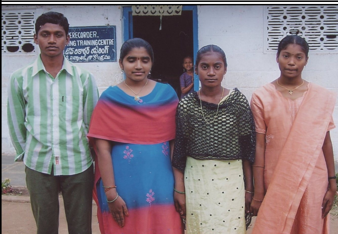
A group of Alumni from Tenali school