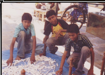
Chalk Making Workshop