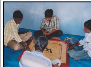
Children playing games

2007: Child recreation center was built to commemorate the memory of Uma, founder's wife who passed away in June 2006. The center is equipped with different kinds of indoor games as a form of entertainment for the children during recess time.