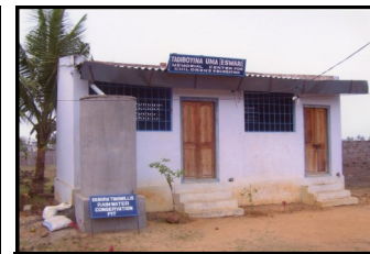
Uma's Memorial Centre for Indoor games for kids

2008: Rainwater water conservation project was established to preserve and supply water to children.