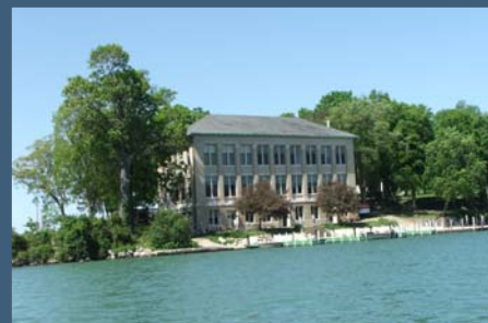
Stone Laboratory: Ohio's Lake Erie Laboratory Since 1895