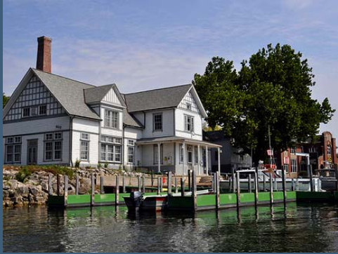
Research Building with AVC in Background