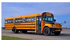
48 Passenger School Bus