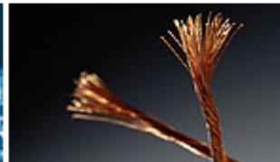
Going High Speed