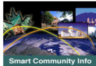
Smart Community Info

It's a community with a vision of the future that involves the use of information and communication technologies in new and innovative ways to empower its residents, institutions and regions as a whole.