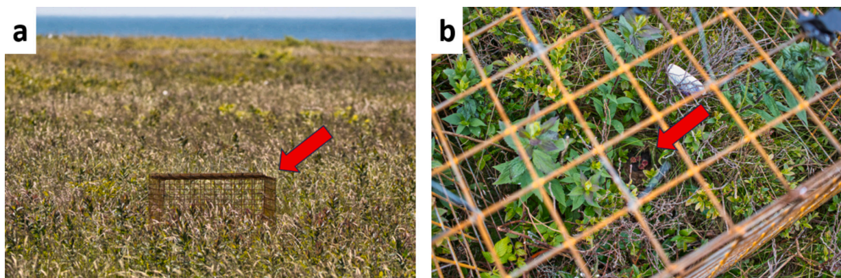
Fig. 1. Images of predator enclosures covering Savannah sparrow nests in South Field, Kent Island, NB. a) enclosure (red arrow) protecting a Savannah sparrow nest from aerial predators. b) close up view of an enclosure protecting a nest with Savannah sparrow nestlings (red arrow).

To determine corticosterone levels in Savannah Sparrows, we obtained blood samples from breeding females. Females were captured by mist-net once during the first brood period, either during the incubation